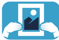
Procurement Item donations