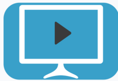
Leaderboards Display activity