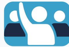
Sign Ups Volunteers